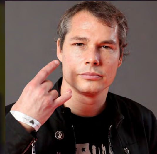
SHEPARD FAIREY American Artist

Shepard Fairey is best known for his iconic OBEY Andre the Giant design and the Barack Obama "Hope" poster used during the 2008 U.S. Presidential elections.